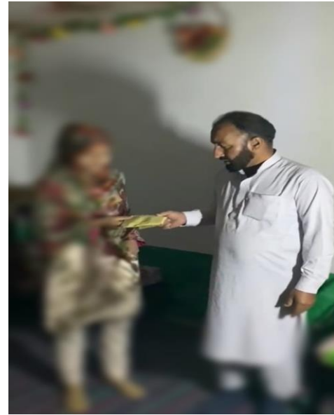
Distribution of Cash